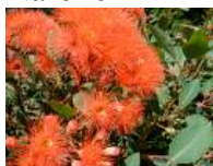
Euc. Dwarf. Orange